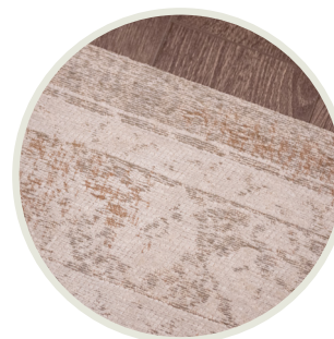
06 Louis de Poortere Rug by John Lewis