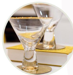
05 Martini Glasses by Maisons du Monde