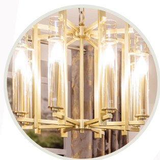
01 Light Pendant by RV Astley