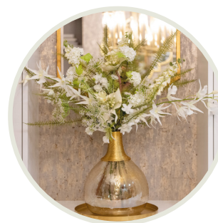
03 Faux Flowers by Parlane