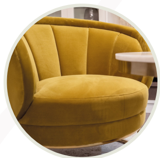
04 Occasional Chair by Liang and Eimil