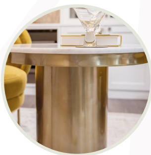
02 Coffee Table Podium by Liang and Eimil