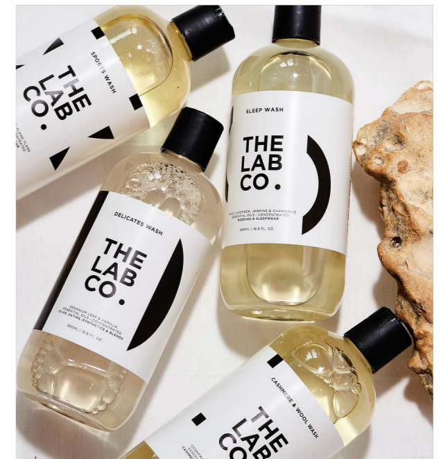
4 Eco laundry care from £5 Elevate your everyday laundry routine with no-nasty fashion care. Keeping the planet clean as well as your clothes. www.thelabco.com

From growing your own food to organic household cleaning, Christine Liu gives us tips and advice on living sustainably. www.waterstones.com