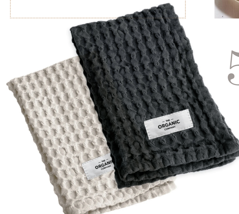
5 Big waffle washcloth £9.22 Opting for reusable products is one of the best ways to transform your home into an eco-friendly household. These large reusable washcloths have a beautiful waffle aesthetic and are super practical in the kitchen. www.theorganiccompanydk.com