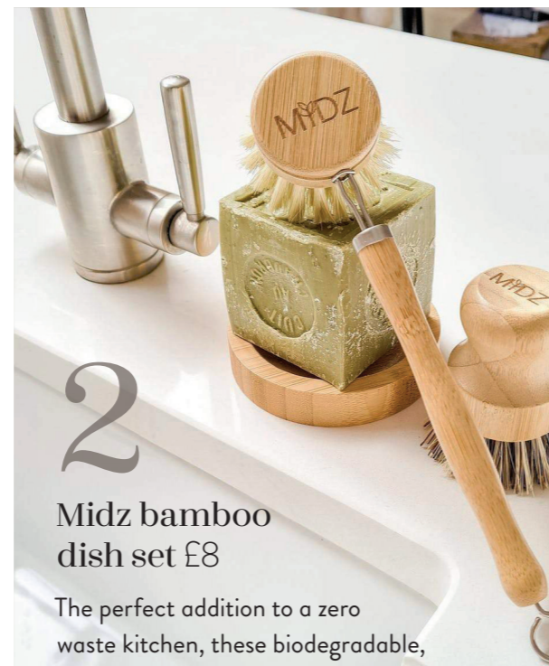
2 Midz bamboo dish set £8

Reusable glass storage is a great way to keep food fresh and limit waste. Fill these ethically handmade jars with nuts, grains and flours from your local wholefoods store for a plastic-free pantry. www.nkuku.co.uk