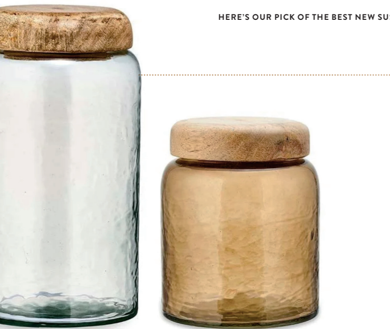
1 Charal storage jars from £35