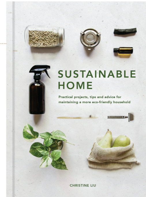
3 Sustainable home book £18

The perfect addition to a zero waste kitchen, these biodegradable, compostable and recyclable dish and pot brushes are made with natural bamboo and sisal. Ideal for washing dishes and scrubbing your homegrown veggies. www.midzplasticfree.uk